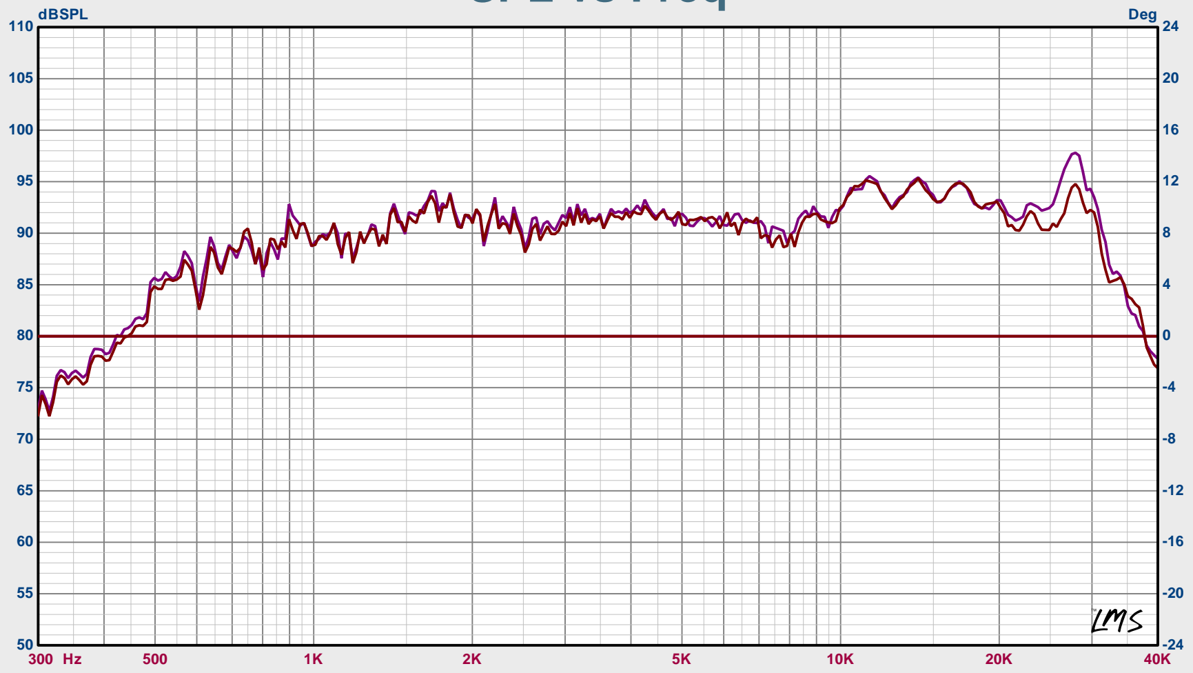
Fig 3. A pair of CQ76B